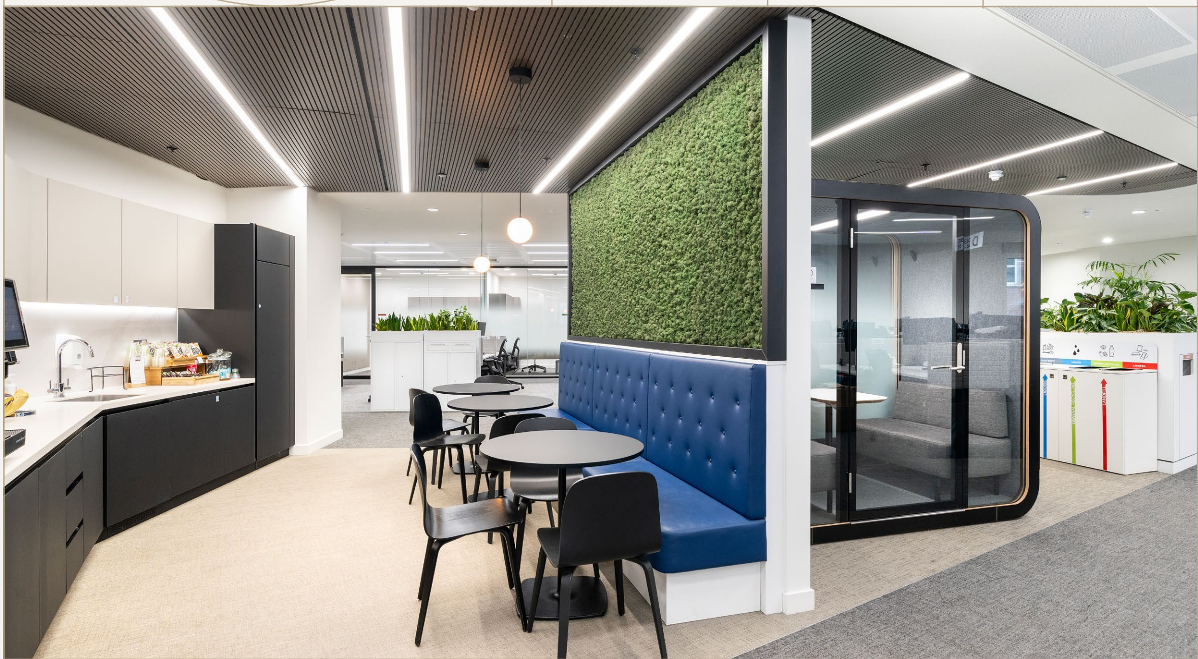
ABOVE KITCHENETTE / BREAKOUT