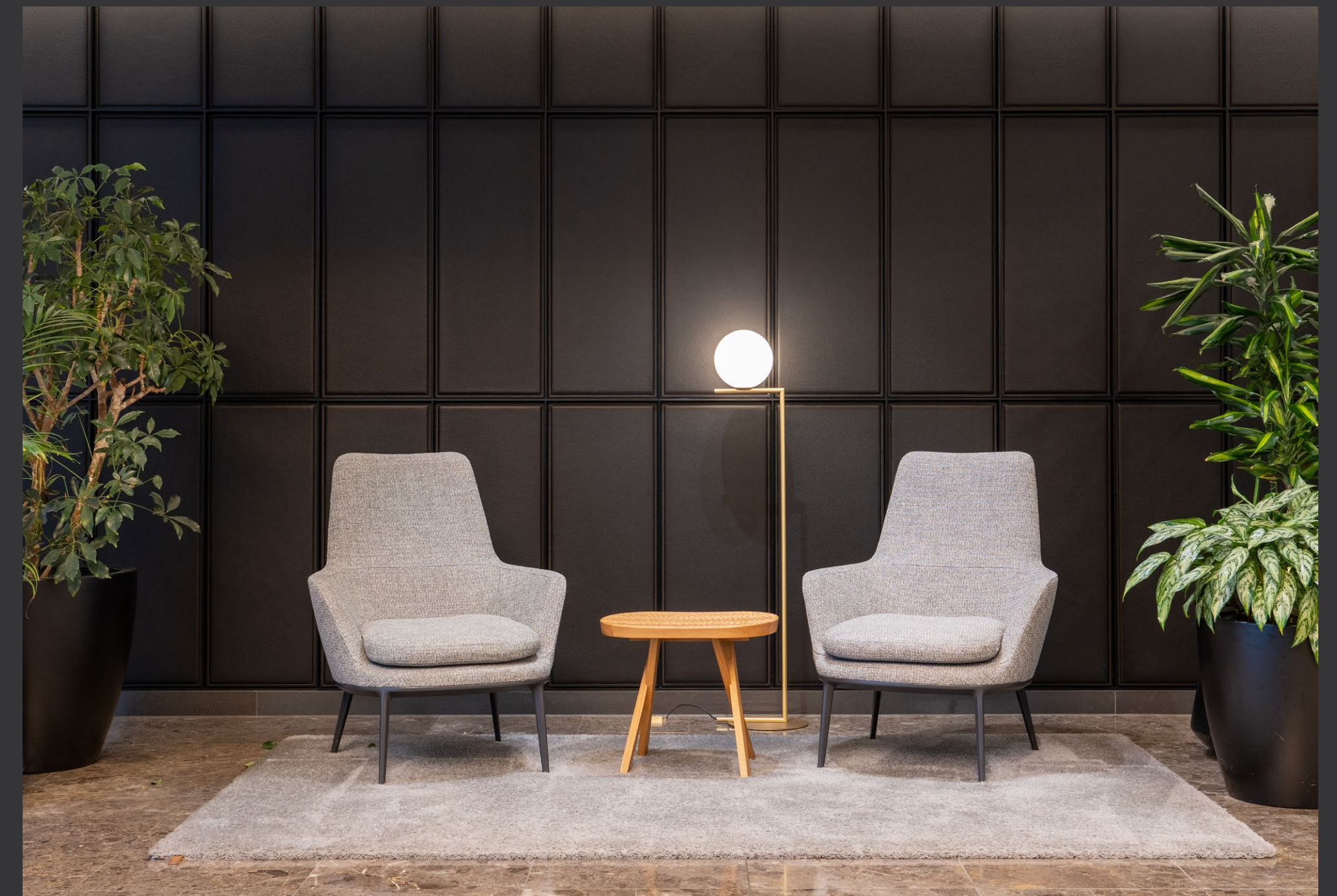
ABOVE WELCOME LOUNGE

The fitted first floor is ready for immediate occupation and includes ample meeting rooms, collaborative breakout areas and kitchenette.