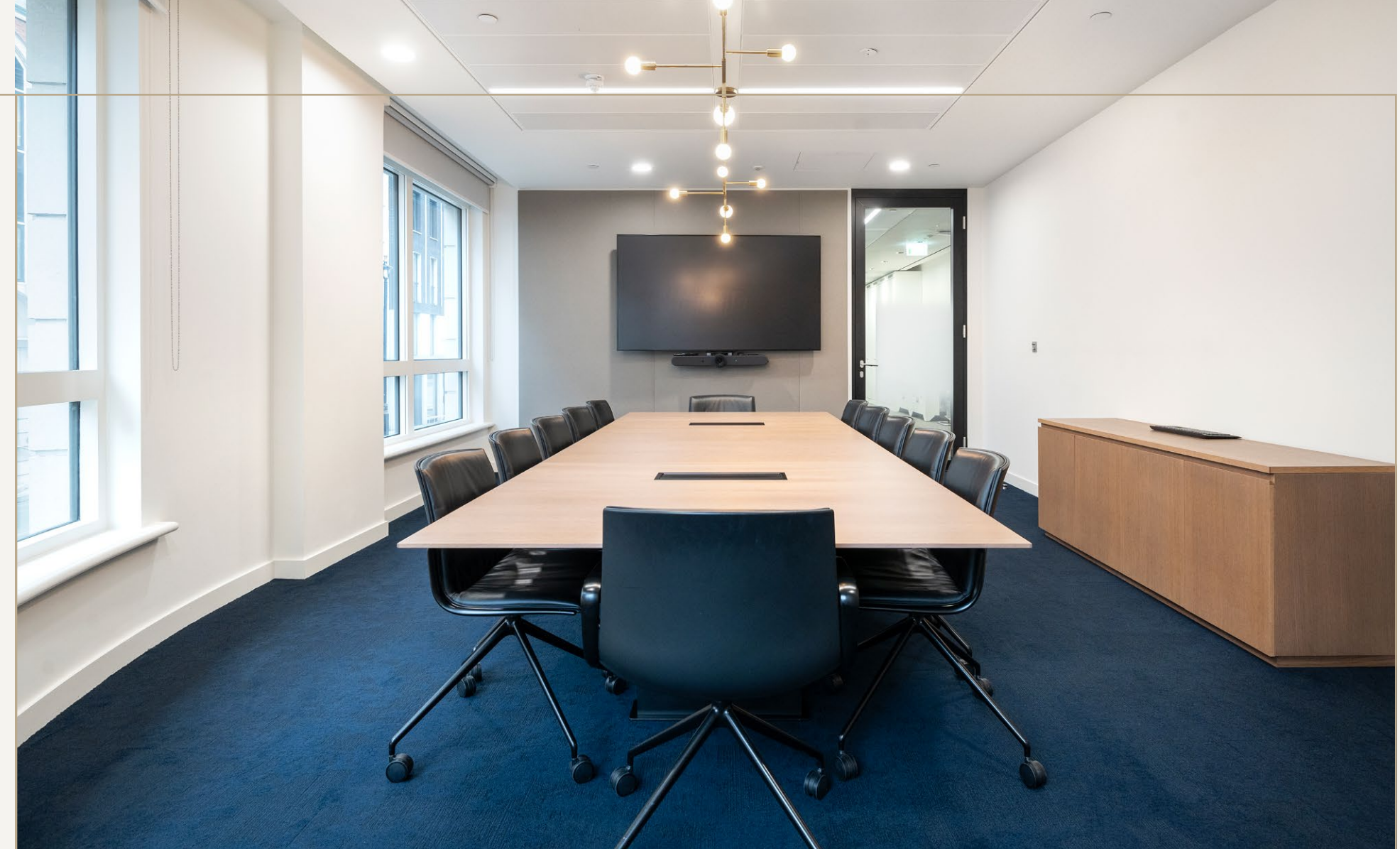
RIGHT 12 PERSON MEETING ROOM